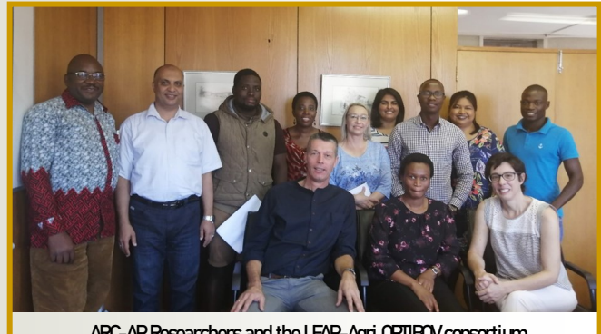
ARC-AP Researchers and the LEAP-Agri OPTIBOV consortium members during their visit in South Africa

ARC-AP is leading OPTIBOV's Work Package 6: Training and Dissemination of knowledge generated to stakeholders i.e., smallholder farmers, cattle breed associations and especially women and the youth. In November 2019, LEAP-Agri OPTI-BOV partners visited South Africa to conduct training mainly to launch and make awareness of the project, emphasise the importance of farmer's active participation, practical demonstration of project protocols and use of the mobile App for the exchange of project data and information. In addition, to train farmers about the importance of indigenous/local genetic resources and impact of climate change on livestock production.